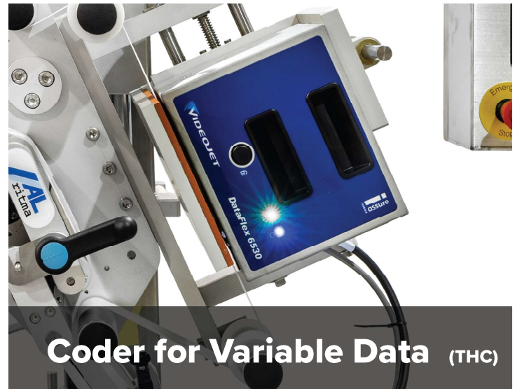
Coder for Variable Data (THC)