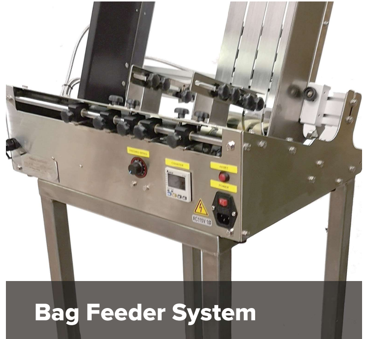
Bag Feeder System