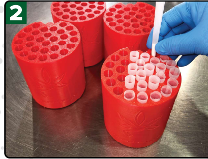
2 Insert the empty cones into the pods