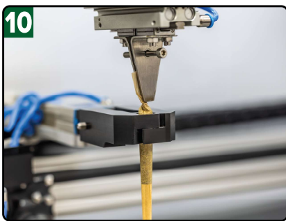
The BoxFinish-Er will twist automatically