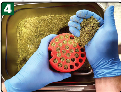
4 Fill the pods with ground product