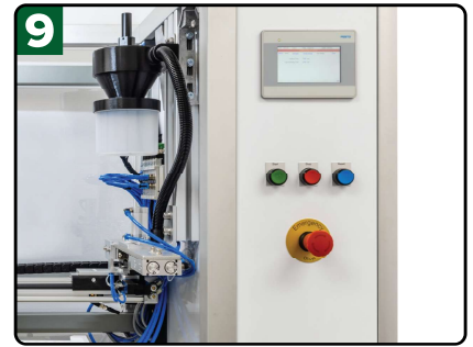
Start the BoxFinish-Er's cycle