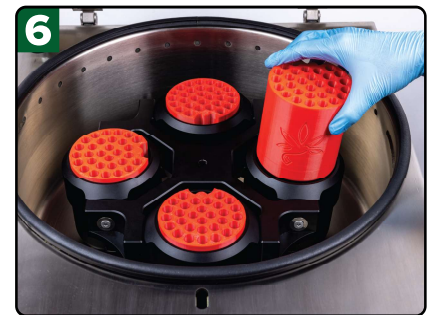
6 Insert the pods into the Hummingbird

Producing top-shelf quality pre-rolls doesn't have to be difficult, time-consuming, or expensive. With the PreRoll-Er STR , you can give your customers an unmatched experience at a better rate than the competition.