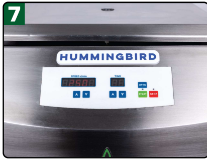
Start the Hummingbird cycle for 15 sec. at 2,200 rpm