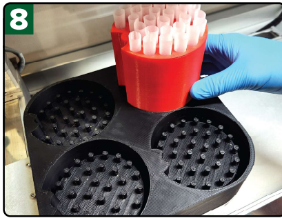
Place the pods inside the BoxFinish-Er tray