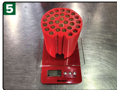
5 Weigh check the filled cones and adjust if needed.