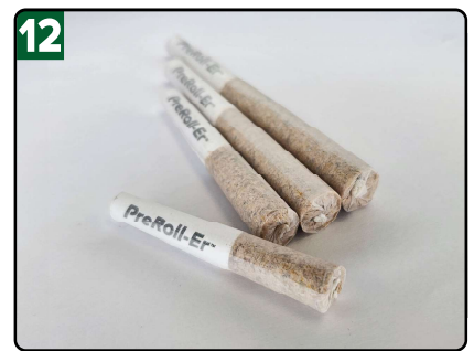
Final product is ready