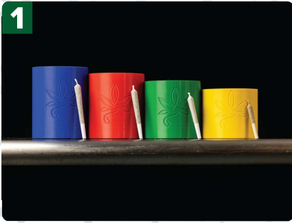
1 Choose your pods size 109mm, 98mm, 84mm and 70mm Custom sizes available